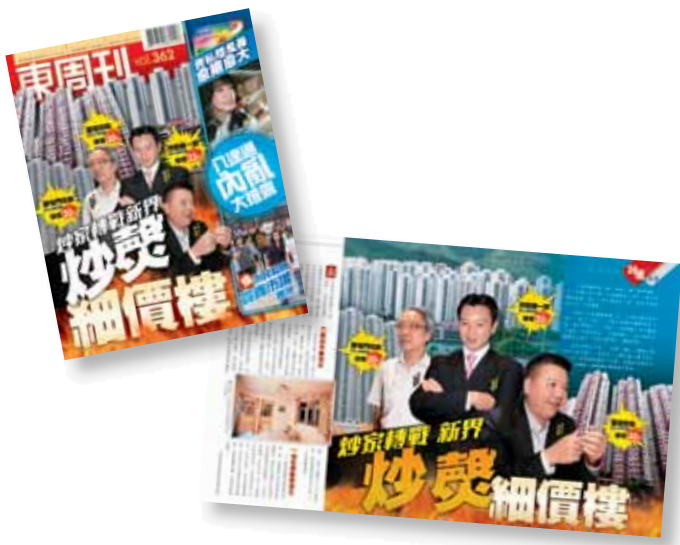
From: 東周刊 Vol. 362, 4th August 2010

the company has entrenched itself in the entry-level private property market; a segment that shows promising growth in the years to come.